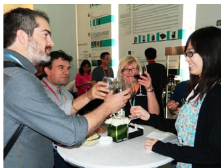
轻松愉快的 PDC 交流晚宴 Relaxing PDC networking dinner

PDC 设计廊已正式运营；并将组织设计比赛、设计培训考察等活动；同时，吸收中国企业会员、国际买家会员和境外设计师会员，为彼此的交流和合作创造最直接、最有效的平台。