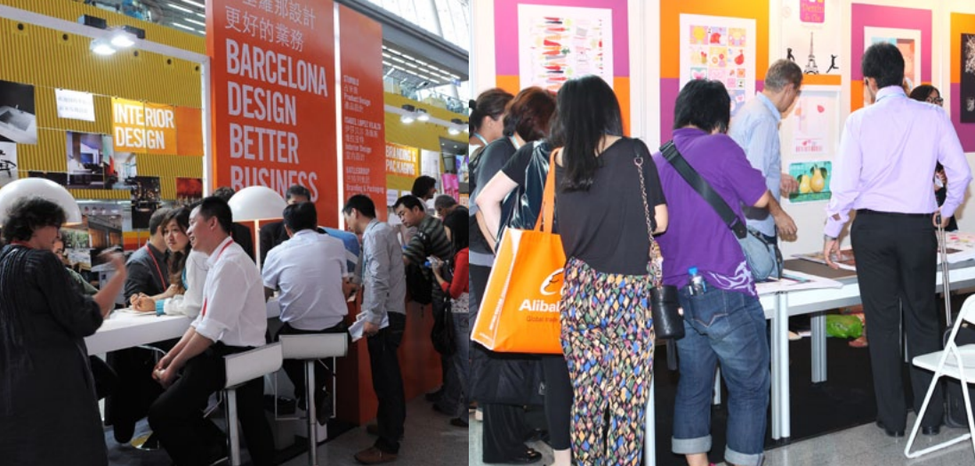
西班牙工业设计公司展示点 Spanish Industrial design company