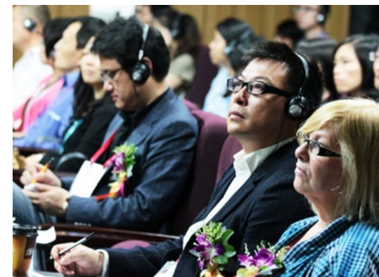
来宾认真聆听嘉宾发表演讲 Audiences listen intently to the guest speaker's presentation