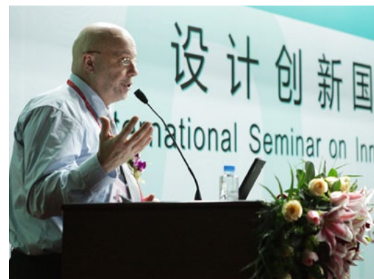
设计师嘉宾发表演讲 Designers make speech

PDC organizes design forums in various fields, with speakers chosen among excellent international designers or from Chinese brand enterprises, sharing their experience and knowledge on industrial design trends, product design concepts, international marketing, and brand building and management.