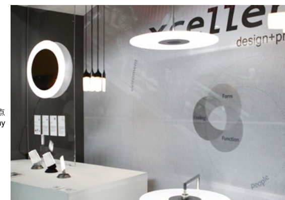
台湾家具设计公司展示点 Taiwan furniture design company