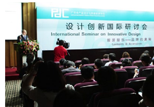
设计创新国际研讨会 International Seminar on Design Innovation