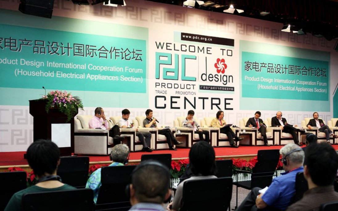
产品设计国际合作论坛 Product Design International Cooperation Forum