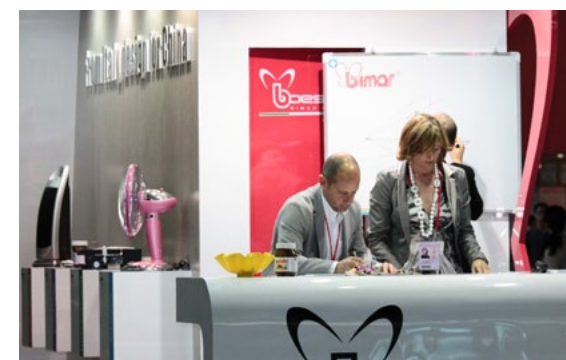
意大利设计公司展示点 Italian design company