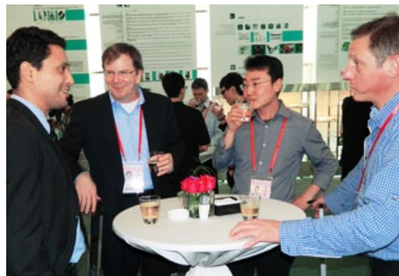
设计师与企业朋友在 PDC 交流晚宴上相互交流 Designers and Chinese enterprises representatives communicate with each other happily in PDC Networking Dinner